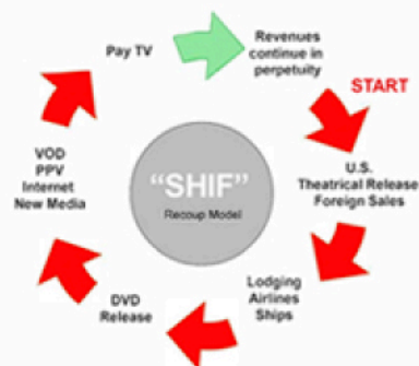
18 MONTH REVENUES BASED ON A $5M DOMESTIC BOX OFFICE